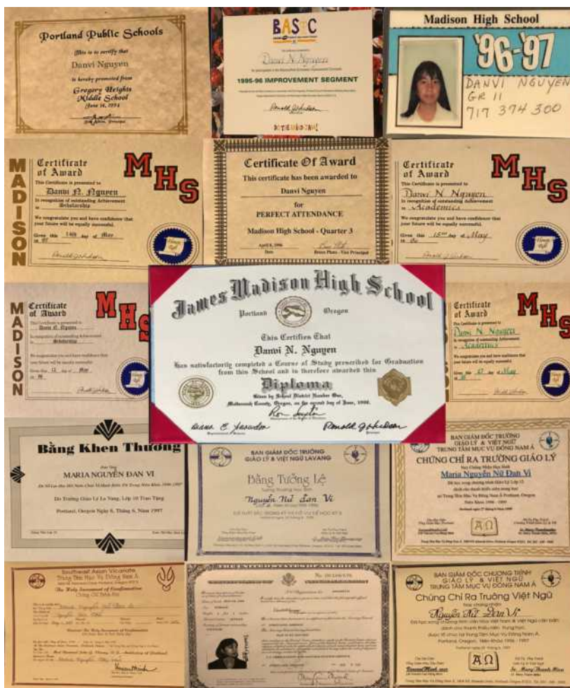
High School Awards