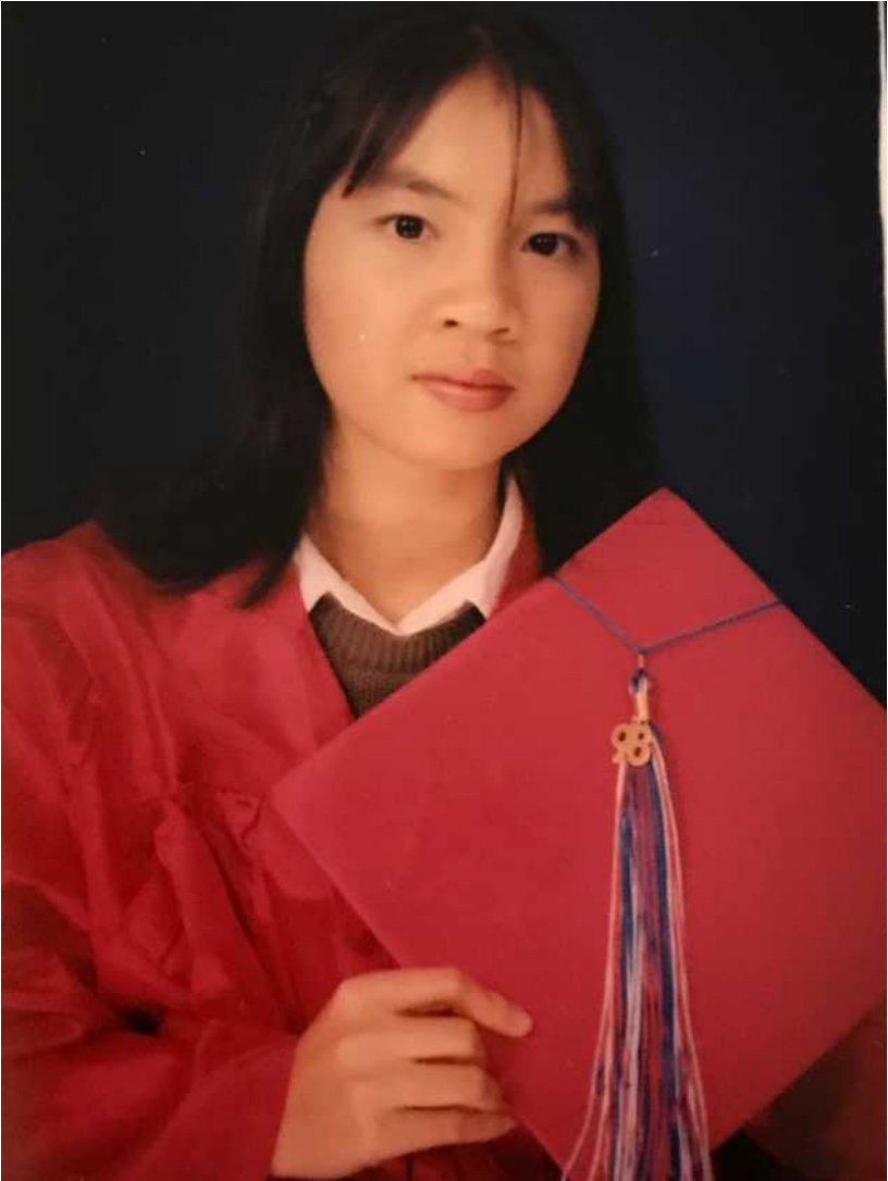
High School Graduation