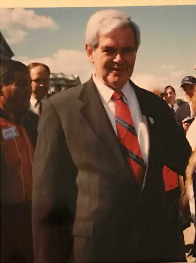
Newt Gingrich 1998